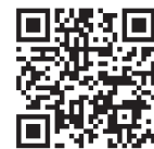
nano tech Website