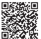
Terms and Conditions